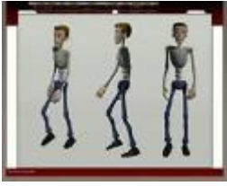
Modeling, Rigging and animation using XSI