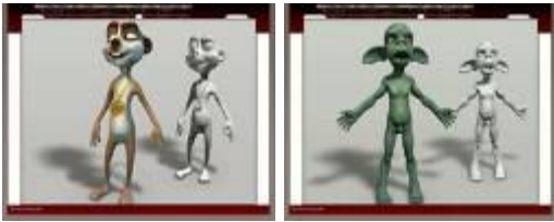
Modeling and rigging using XSI and Zbrush